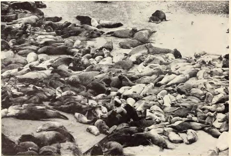
Fig. 7. A group of subadult elephant seals (center) surrounded by male California sea lions. Several sea lions are on top of elephant seals. Año Nuevo Island, California, November 13, 1963